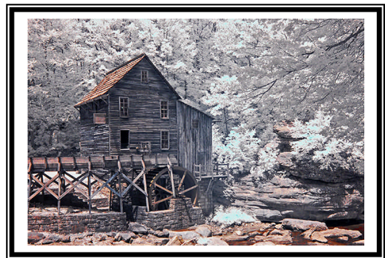
Glade Creek, Tennessee – Infrared – 2007 Jim Urquhart

Images shall be jpg, 1024 x 768, quality 8-10. A thin stroke of up to 5 pixels in width will be allowed. Having images correctly named is critically important. An e-mail defining the correct file-naming convention was e-mailed to the membership. You can also check our Web site ( www.grandphotos.net ) in the Competition section. Grand Photos members participate very well in the ACCC competitions and we encourage you to enter your photos and then attend the show on Nov. 10 th to see them displayed.❖