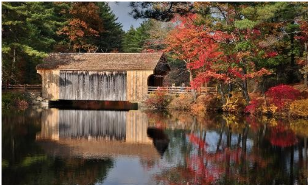
“Bridge at Sturbridge Village

Have a wonderful holiday season, everybody!