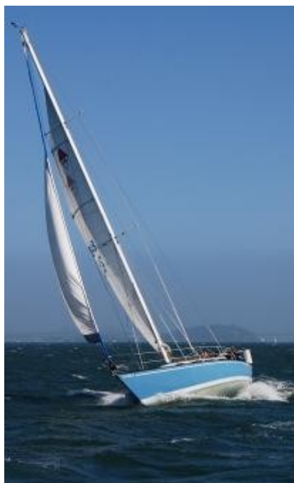
“A Clear Day on SF Bay” by Mary Gamble