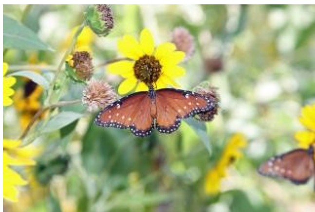
“Lunchtime” by Joe Scanlon