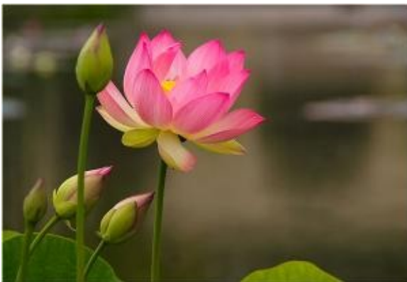
“I don’t-know-what-kind of tropical water flowers!!”

By all means go to the Botanical Garden greenhouse (free) and if you are lucky, the magnificent “I-don’t-know-what-kind of tropical water flowers” will be in bloom in the reflection pool...We stayed at least an hour there! Go inside, set up your tripod, and have fun with the orchids, the lilies (Easter) the bonsai etc, etc, etc. I won’t tell you how many more...explore and enjoy yourself! If you are into roses, their rose garden is a short walk away.