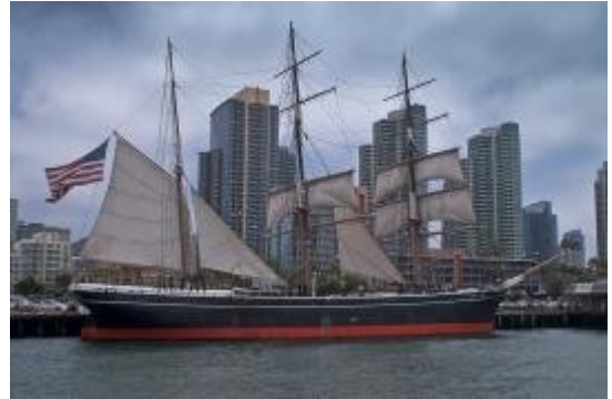
"Star of India"

When you get hungry, all that fresh salt air will sharpen your appetite for one of many wonderful seafood restaurants on the harbor. Hop on one of the bicycle rickshaws and head alongside the water. We ate at a great restaurant next to the Bob Hope memorial garden, next to the huge statue of the sailor kissing his girlfriend. (I got a picture of people standing under the statue, trying to peek under her dress). Lots of laughs. On Sunday morning, Hornblower's outstanding Sunday Brunch and Harbor tour is a delight for the tummy and the eyes!